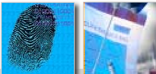
High Performance Print Lifters